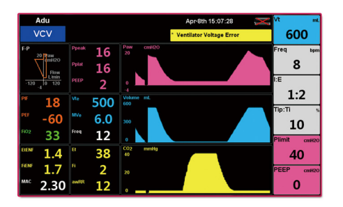
8" Screen display

Autoclavable PPSU material (up to 134°C).